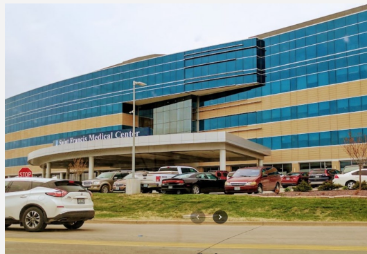
Saint Francis Medical Center in Cape Girardeau, MO

(The Region will pay for overnight accommodations for each minister or delegate).