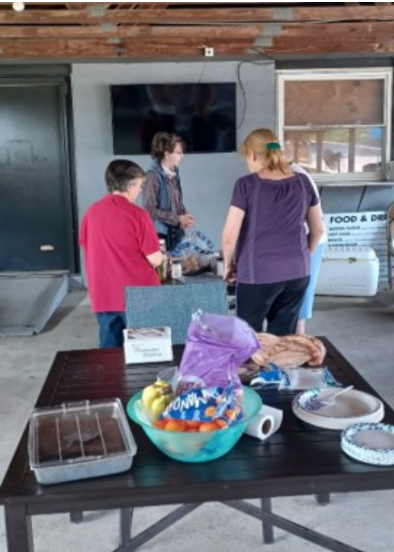
On July 22, members of the St. Francis of Assisi Fraternity enjoyed some very nice fellowship, picnic style, at Immaculate Conception Parish in Arnold, MO.